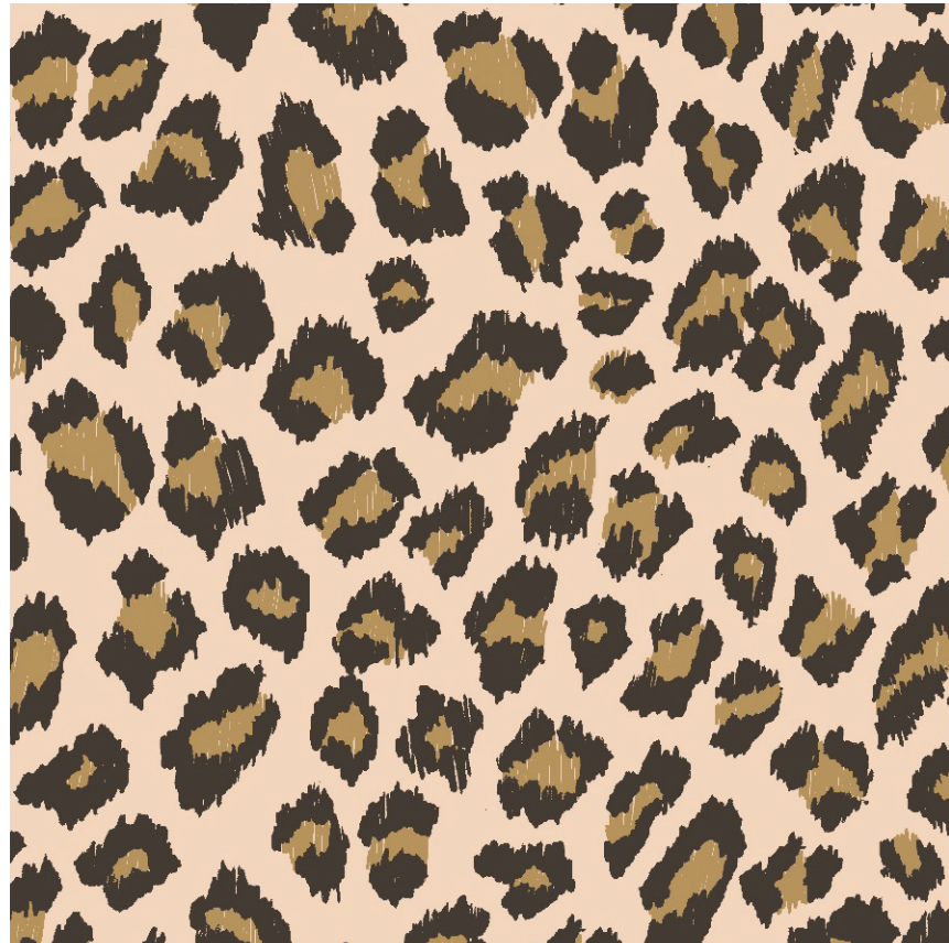
CARAMEL MULTI ABSTRACT LEO (MINI)