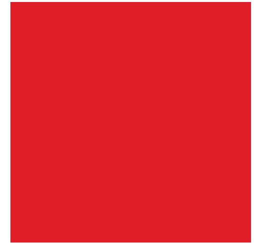
BRIGHT RED NB-7936